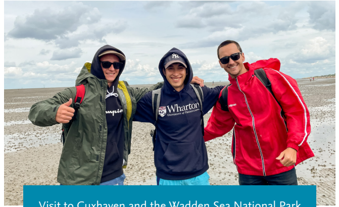
Visit to Cuxhaven and the Wadden Sea National Park