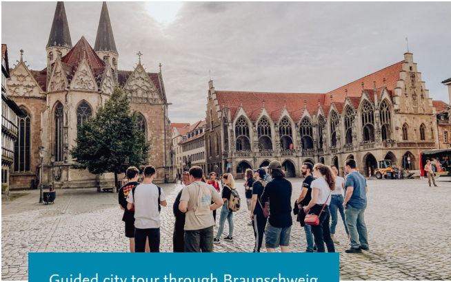
Guided city tour through Braunschweig