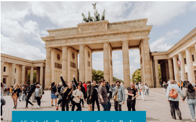
Visit to the Brandenburg Gate in Berlin